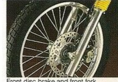
Front disc brake and front fork