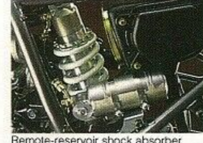
Remote-reservoir shock absorber