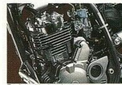
Engine with electric starter